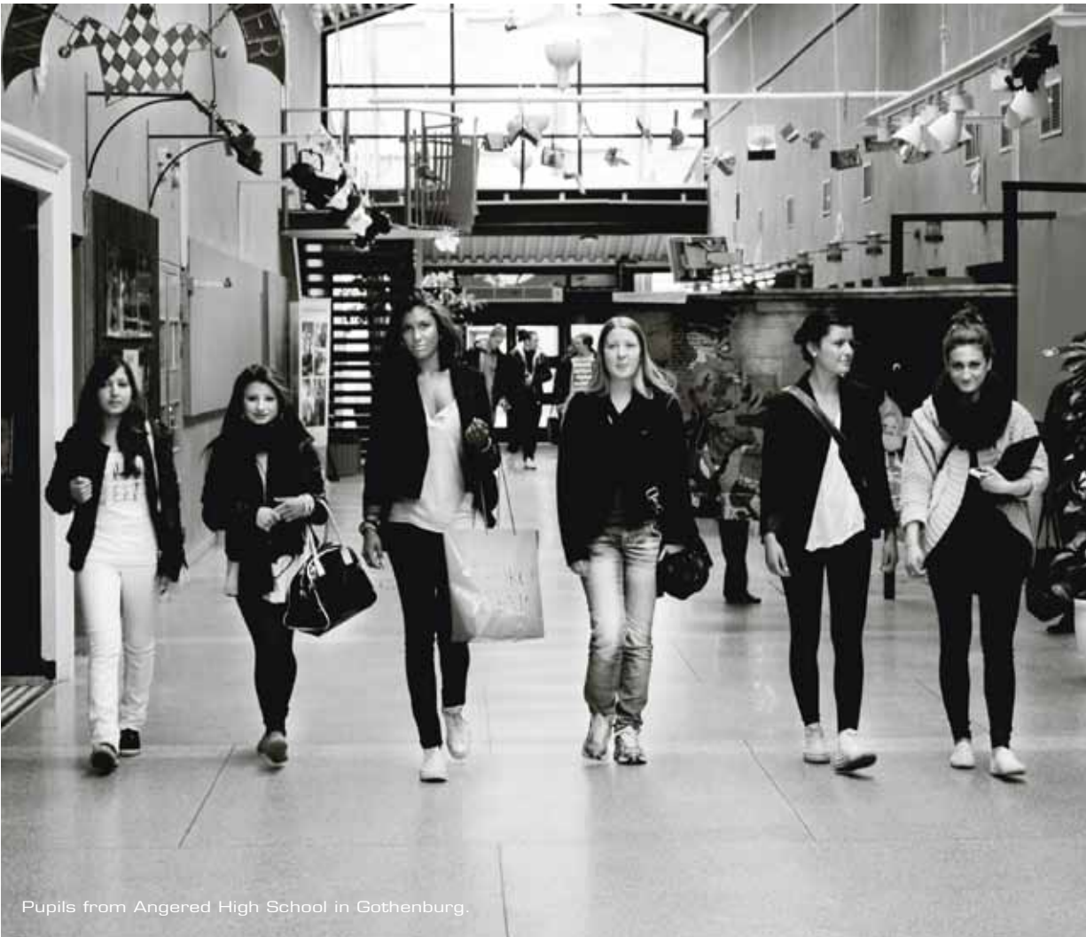
Pupils from Angered High School in Gothenburg.

Gothenburg University which means that the pupils gain an early insight into the life of a law student.